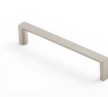
Dull Brushed Nickel